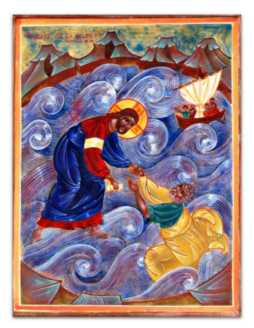
Our Savior Lutheran Church