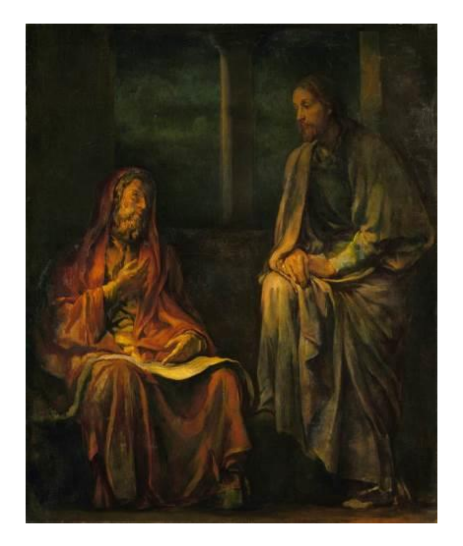
Our Savior Lutheran Church