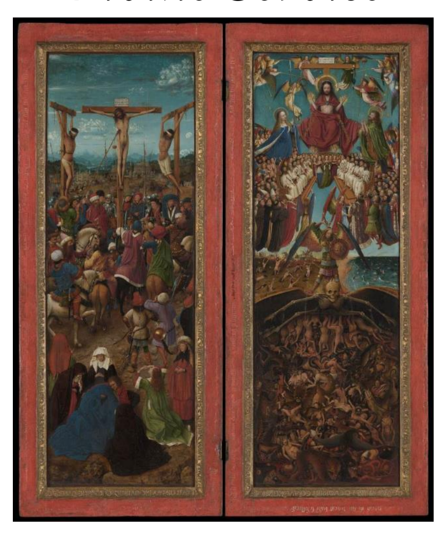
Our Savior Lutheran Church